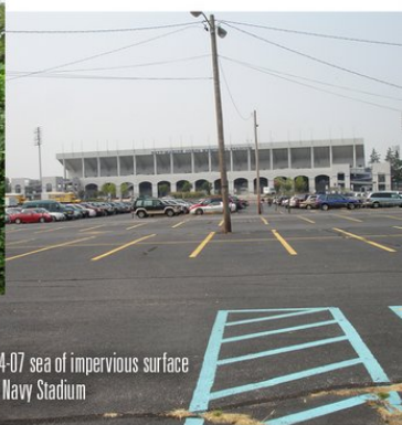
8-4-07 sea of impervious surface at Navy Stadium