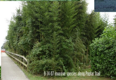
9-14-07 invasive species along Poplar Trail