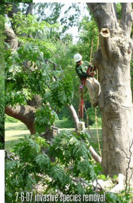
7-6-07 invasive species removal