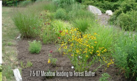
7-5-07 Meadow leading to Forest Buffer