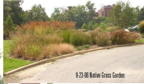
9-23-06 Native Grass Garden