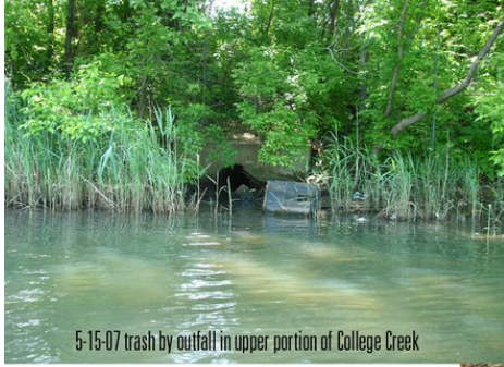
5-15-07 trash by outfall in upper portion of College Creek