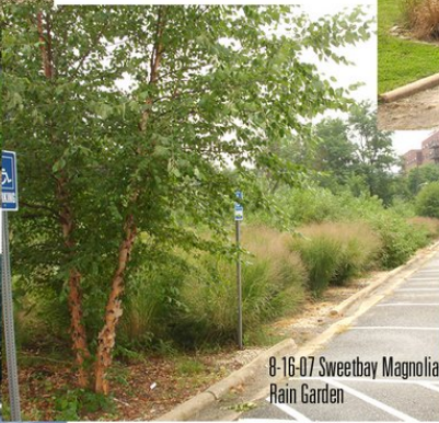
8-16-07 Sweetbay Magnolia Rain Garden