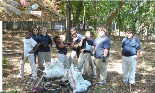
10-2-07 students remove several piles of trash from Adams Academy grounds