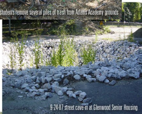
9-24-07 street cave-in at Glenwood Senior Housing