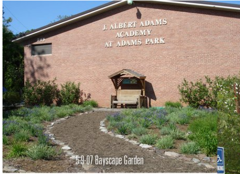
5-9-07 Bayscape Garden