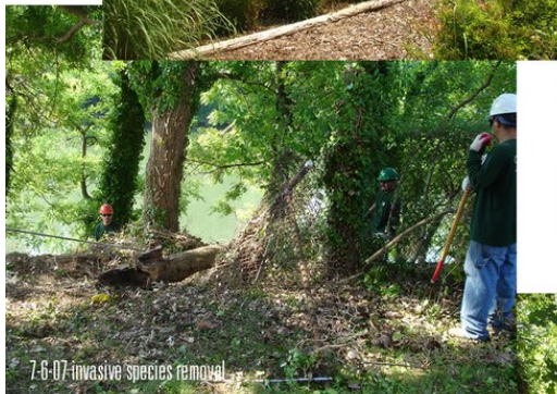
7-6-07 invasive species removal