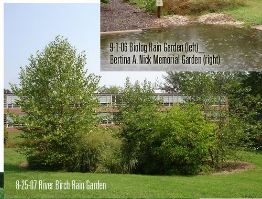
8-25-07 River Birch Rain Garden