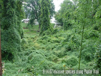
9-14-07 invasive species along Poplar Trail