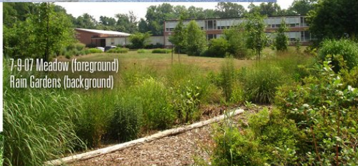
7-9-07 Meadow (foreground) Rain Gardens (background)