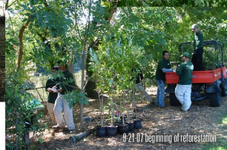
9-21-07 beginning of reforestation