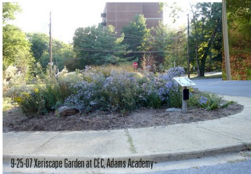
9-25-07 Xeriscape Garden at CEC, Adams Academy