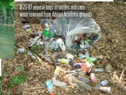
8-25-07 several bags of bottles and cans were removed from Adams Academy grounds