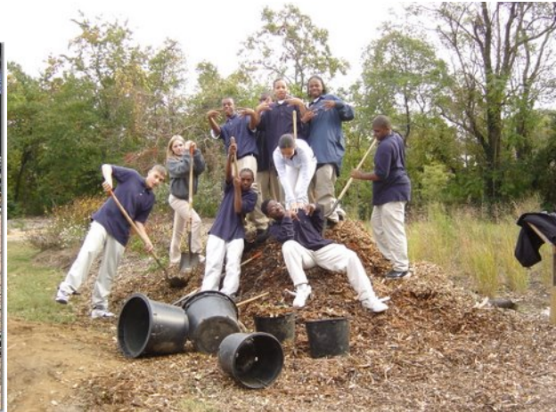
May 11, 2004, Adams Academy Students and Teachers Install the Catch-All Rain Garden in the Back of the School Building