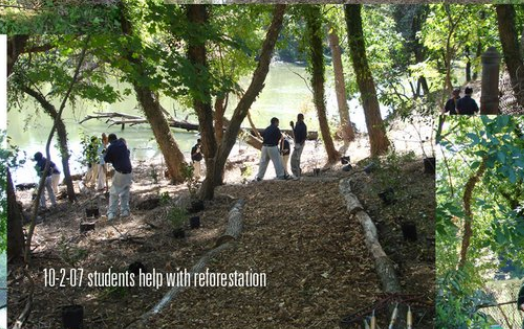
10-2-07 students help with reforestation