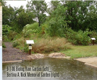
9-1-06 Biolog Rain Garden (left) Bertina A. Nick Memorial Garden (right)