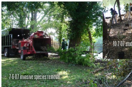
7-6-07 invasive species removal