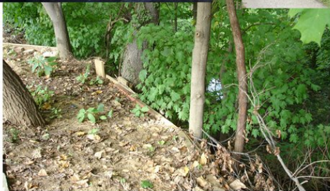
^ 9-22-07 retaining wall at Brewer Cemetery, erosion occurring below